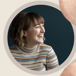
HANNAH SCHINDEL PHOTOGRAPHER